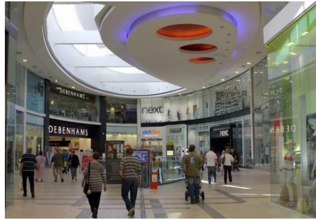
County Square - Ashford